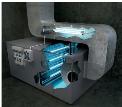
Air Handler & Airstream Disinfection