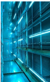
Air Handler Disinfection

Please contact Fresh-Aire UV to discuss your specific application: 1-800-741-1195 or email sales@FreshAirUV.com .