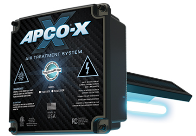
Fresh-Aire UV APCO-X whole-house air purifier

UV disinfection systems for HVAC are an ideal proactive measure to complement filtration. Microorganisms, particularly viruses, are so small that filters are mostly ineffective. The UV systems have also been shown to reduce problematic molds and pathogens that are found within the HVAC system and drain pan that would otherwise be introduced and distributed throughout the envelope of the building.